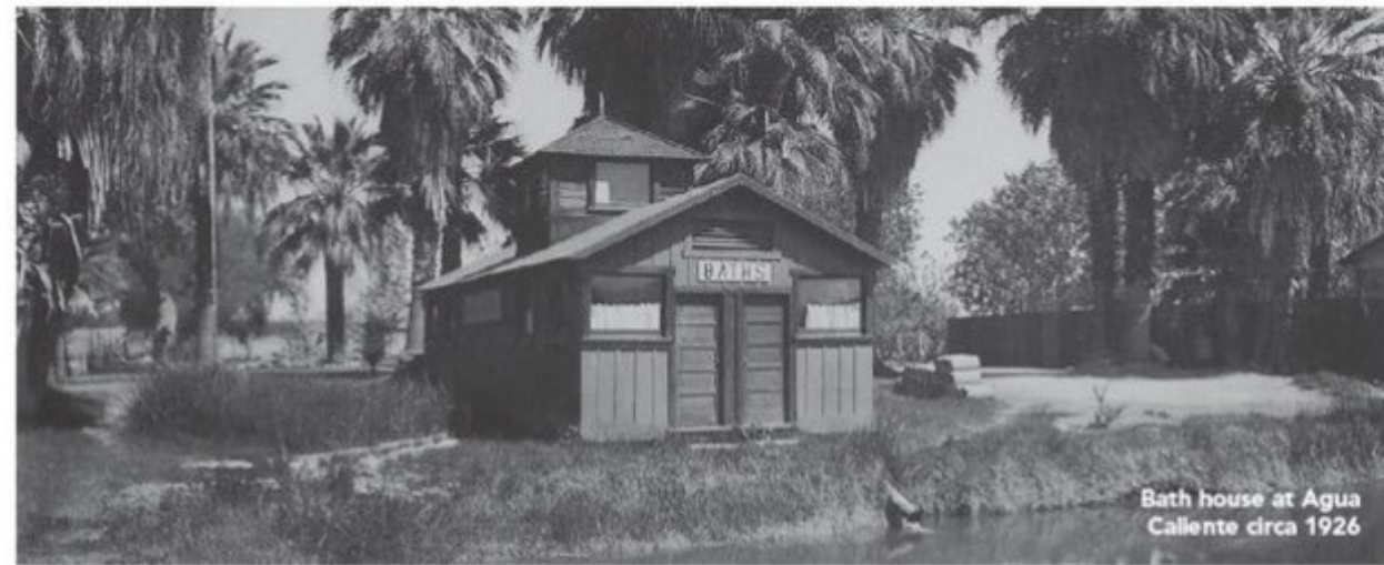
Bath house at Agua Caliente circa 1926

Download the free GREATER PALM SPRINGS WELLNESS PASS for savings and discounts at the region's spas, fitness facilities and yoga studios.