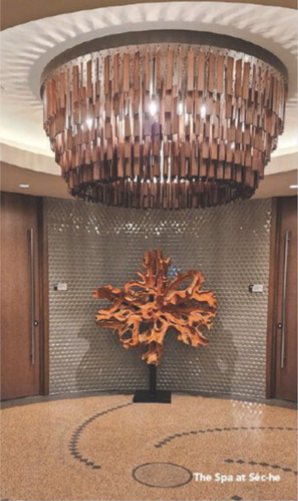
The Spa at Séc-he

"Sharing our culture with our own people and visitors preserves our culture moving forward."