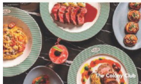
The Colony Club