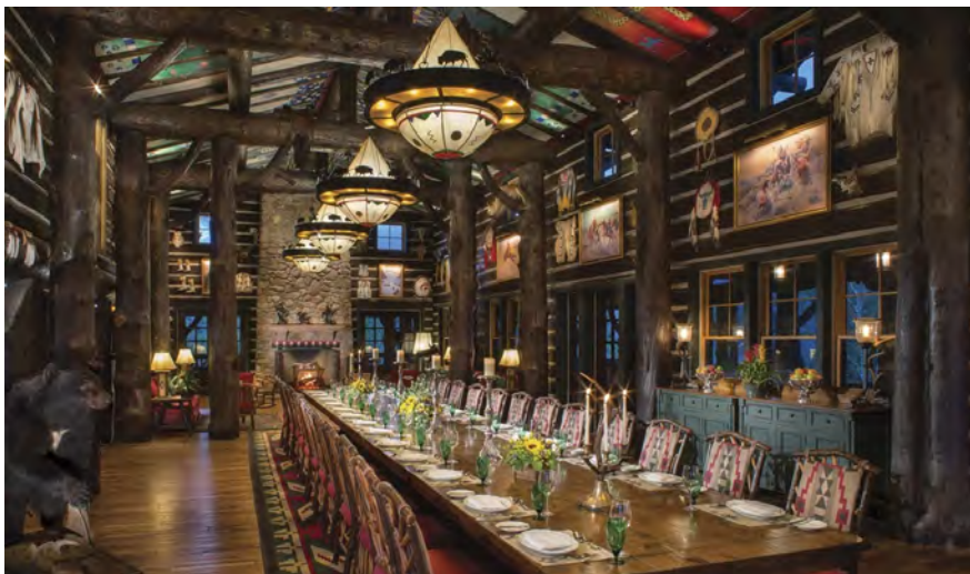
The dining room at the Cloud Camp lodge.

What is the accommodation like? High ceilings, sprawling marble bathrooms and sitting areas make guest rooms feel like European apartments, some with fireplaces, and most enjoying lake and mountain views. Wilderness property Cloud Camp, atop Cheyenne Mountain, consists of 12 luxury cabins and a seven-guestroom lodge.