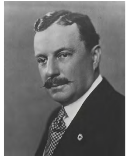
Spencer Penrose.

A complimentary shuttle takes guests the 15km to Seven Falls, next to The Broadmoor's Restaurant 1858 (a log cabin whose name references the year the Colorado gold rush started). An easy walking trail leads to the falls, which tumble down 380-metre canyon walls.