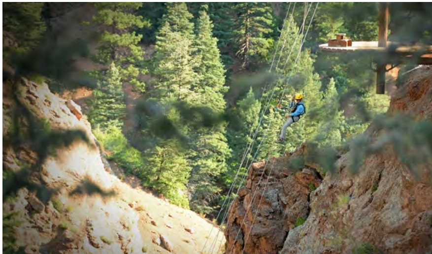
A rappelling course at The Broadmoor.

Founded to house the Penroses' menagerie, the Cheyenne Mountain Zoo now contains 700 animals, including North America's largest giraffe herd; all 17 of them. And then there's the Will Rogers Shrine of the Sun, where Penrose and his wife are entombed. It was dedicated to Rogers simply because the actor/cowboy/humorist died while the 30-metre tower that would be the Penroses' final resting place was being built – and no, the couple's tombs are not on view.