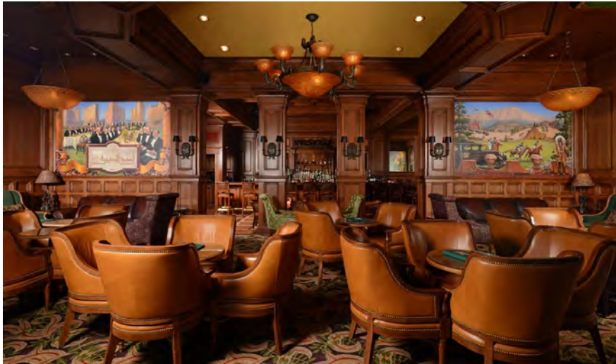
Hotel Bar at The Broadmoor.

Seafood restaurant and steakhouse La Taverner is known for its raw oyster bar; Ristorante Del Lago for its wood-fired pizza; and Parisian-inspired Café Julia for its chocolates.