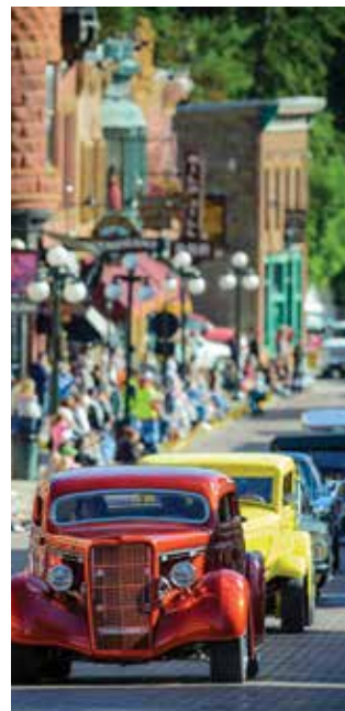
FROM LEFT TO RIGHT: Wooden Legs Brewing Company in Brookings; Kool Deadwood Nights parade.

how his 400-person team carved the presidents' 60-foot-tall faces.