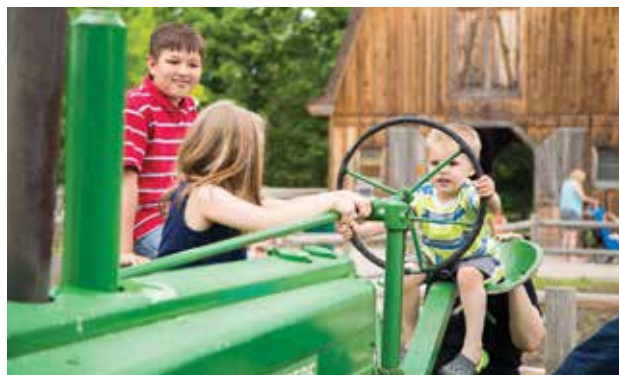
CLOCKWISE FROM FAR LEFT: Needles Highway; Fall pheasant hunting season; Storybook Land.

its list of top 10 domestic destinations for 2015 and also is mentioned in Frommer's recommendation of South Dakota as a top travel spot for the year, too.